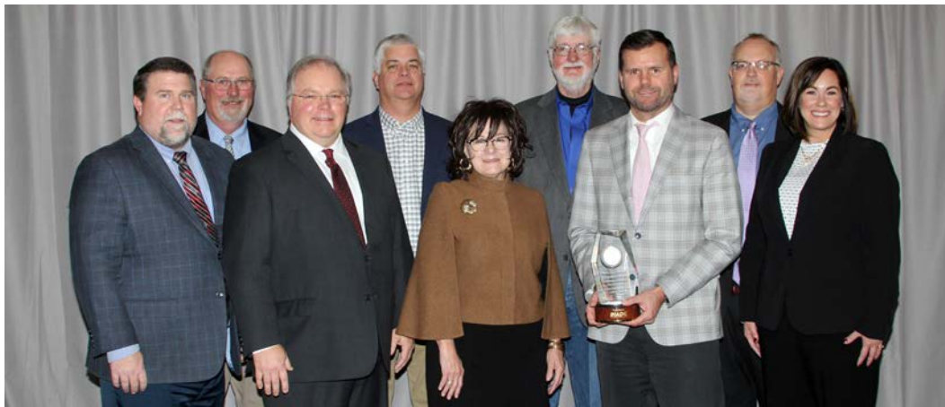
Shell Rock Soy Processors, 2022 Iowa Venture Award "Outstanding Business of the Year"