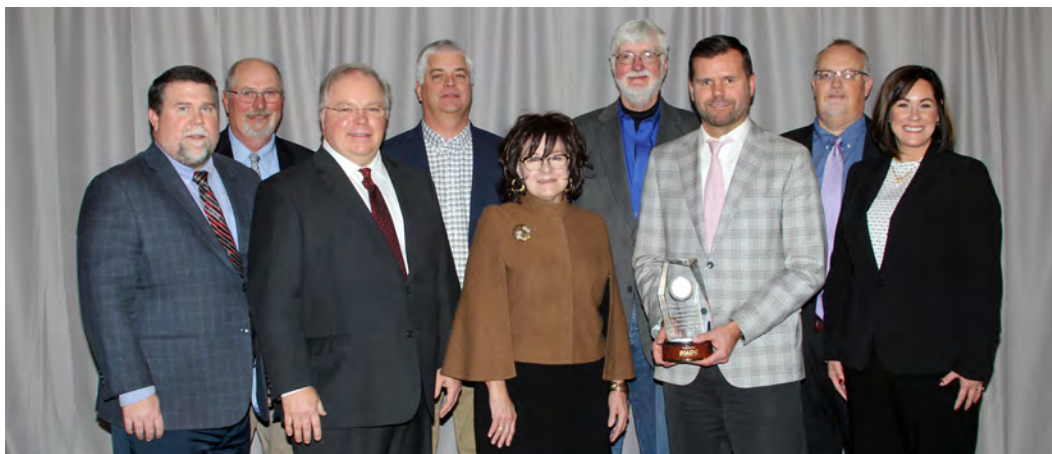
Shell Rock Soy Processors, 2022 Iowa Venture Award "Outstanding Business of the Year"