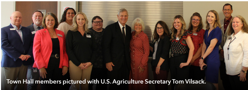
Town Hall members pictured with U.S. Agriculture Secretary Tom Vilsack.