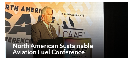
North American Sustainable Aviation Fuel Conference