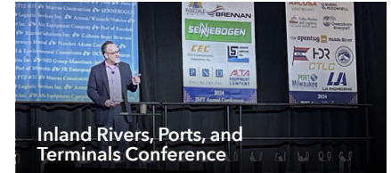
Inland Rivers, Ports, and Terminals Conference

IADG continued its outreach efforts in third quarter by promoting Iowa and marketing member territories at a variety of tradeshows and events.