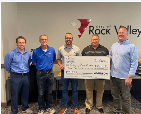
Premier Communications: $10,000 Aureon: $5,000